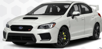
2021-1989 Subaru Sedan, Wagon and SUV